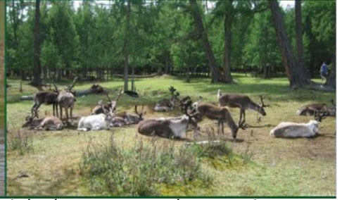
Central Asia. Khuvsgul water is crystal fresh and clear that you can drink the water and see points at as deep as 24.5m. Overnight in tourist Gers camp. (B)(L)(D)